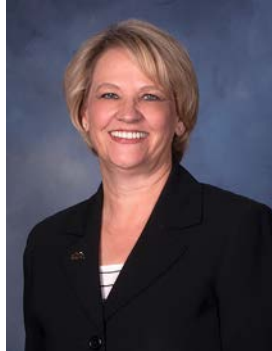
Mayor Debbie Winn